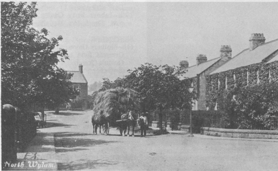
The good old days—or were they? There was little chance of this vehicle speeding through the village in 1920.

Keep your fingers crossed that acceptable terms can be agreed so that work can begin shortly!