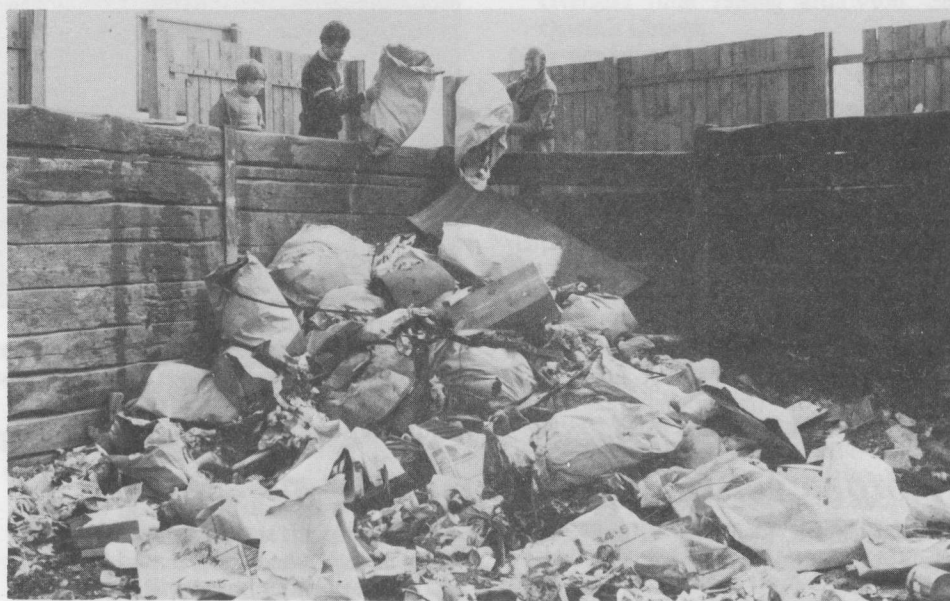
Front page rubbish! Almost all the rubbish in this picture—taken at the West Wylam tip, was collected during the litter clearance campaign.

to dispose of, contact the District Council, or take it to the tip at Broomhouse Road, West Wylam where a convenient compound has been provided, for the use of residents disposing of household rubbish.