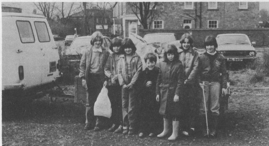
A small but happy group of the youngsters who helped in the litter campaign. They almost hide the trailer loaded with sacks of rubbish.

The Citizens Advice Bureau provide a most useful independent and confidential service of help and advice on any sort of problem.