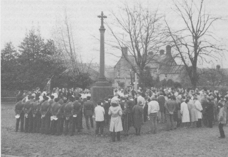
The Remembrance Day service at the War Memorial last November drew wide local support.

* Other events to book in your diary: Matfen Hall Fête on 8th June, Ovingham Goose Fair on 15th June, and Stelling Hall Fête on 1st June.