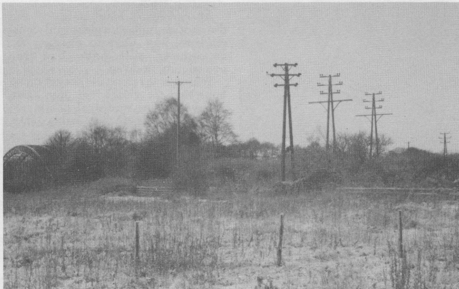
The smaller and neater poles (left) now replace the three larger and heavier poles of the old-style electricity line running from the village to the Hagg and West Wylam.

The problem of speeding vehicles is a worse hazard on the Holeyn Hall Road, and the Parish Council and local residents have requested that the County Surveyor and the Police should examine all possible ways of trying to reduce the speed of traffic, either by more frequent speed checks and/or some special treatment for the road surface.