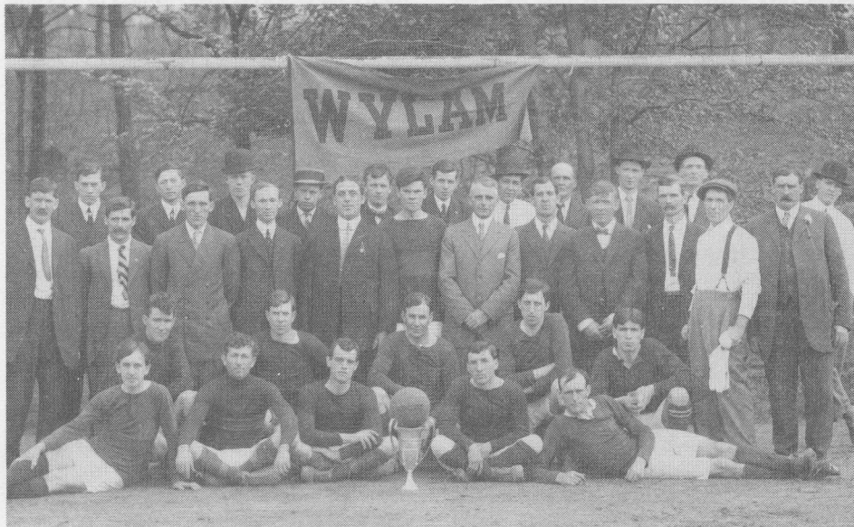
Found on sale at a local "flea-market" this fine photo of the village football team and supporters. Probably taken in about 1910, but can any of our older readers identify anyone in the picture, and the occasion?

It is also right, when we contemplate the destruction of our civilisation as we know it, to come together as a community before God and commit ourselves afresh to work for justice and peace in our world".