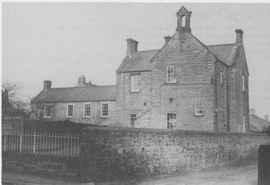
The former colliery-school and the adjoining master's house (itself an earlier school) in Woodcroft Road are two of the local buildings now added to those listed as being of Special Architectural or Historic Interest.

tance of their property and do their best to preserve them for present and future generations.