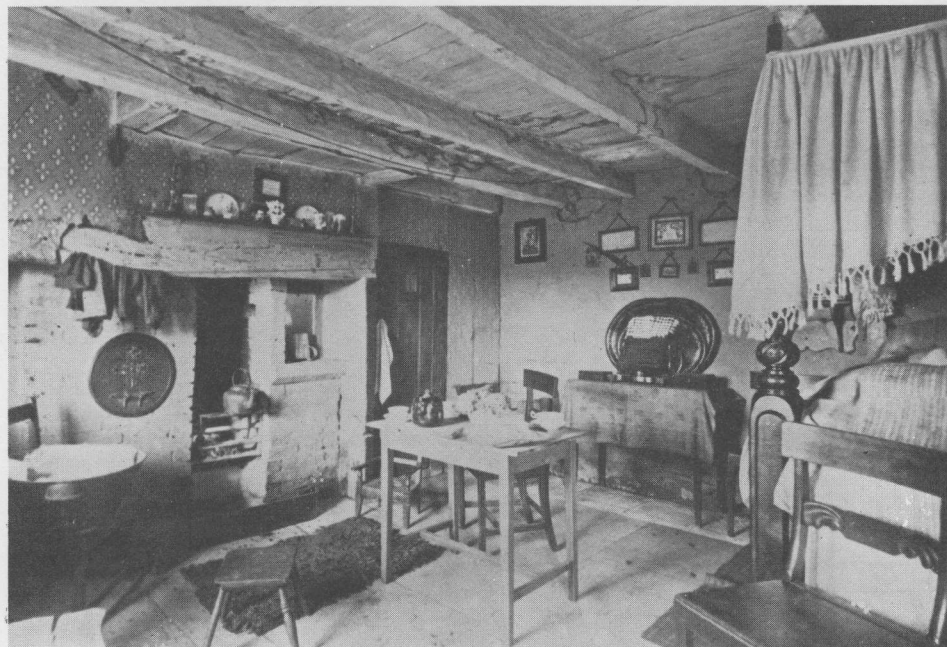
The oldest known photograph of the interior of George Stephenson's birthplace taken in 1881 to commemorate the Centenary of his birth. The National Trust are now hoping to alter the present layout of the room to make it resemble more closely what it would probably have been like in Stephenson's lifetime.