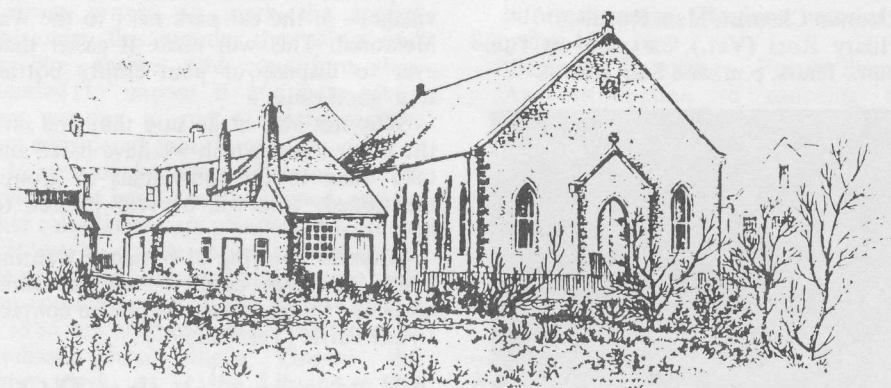
The Methodist Chapel as it is today. If everything goes to plan, the assorted out-buildings to the west of the Chapel should be demolished and work started on the new buildings later in the summer.

Although John Wesley does not mention Wylam in his diaries, he came to Horsley at least nine times during his visits to the North East, and it is likely that many residents of Wylam would have heard him preach at Horsley.