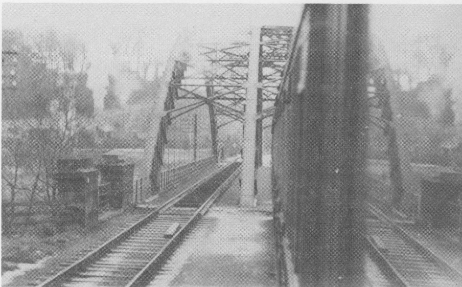
An unusual view—with reflections—taken from the carriage window of a train crossing the bridge at Hagg Bank in 1952.

A new custodian will take over later in the summer, but due to these staffing changes and the building work, the National Trust has decided not to re-open the Birthplace until the new tenant arrives. However, any groups wishing to visit can do so by prior arrangement with the National Trust Office (Tel. 0670 74691).