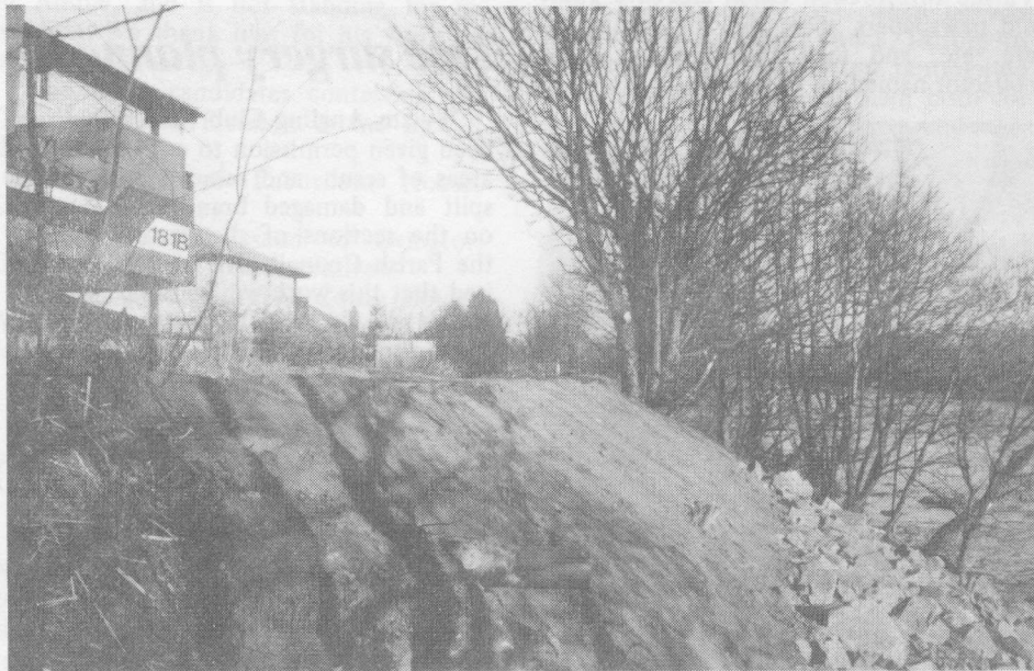
When the surface-water outfall on Stephenson Terrace was replaced earlier this year, the riverbank was also strengthened with boulders to reduce future erosion. Trees have now been planted on the banktop.

Printed for Wylam Parish Council by The Gilpin Press, Houghton-le-Spring DH4 4BA