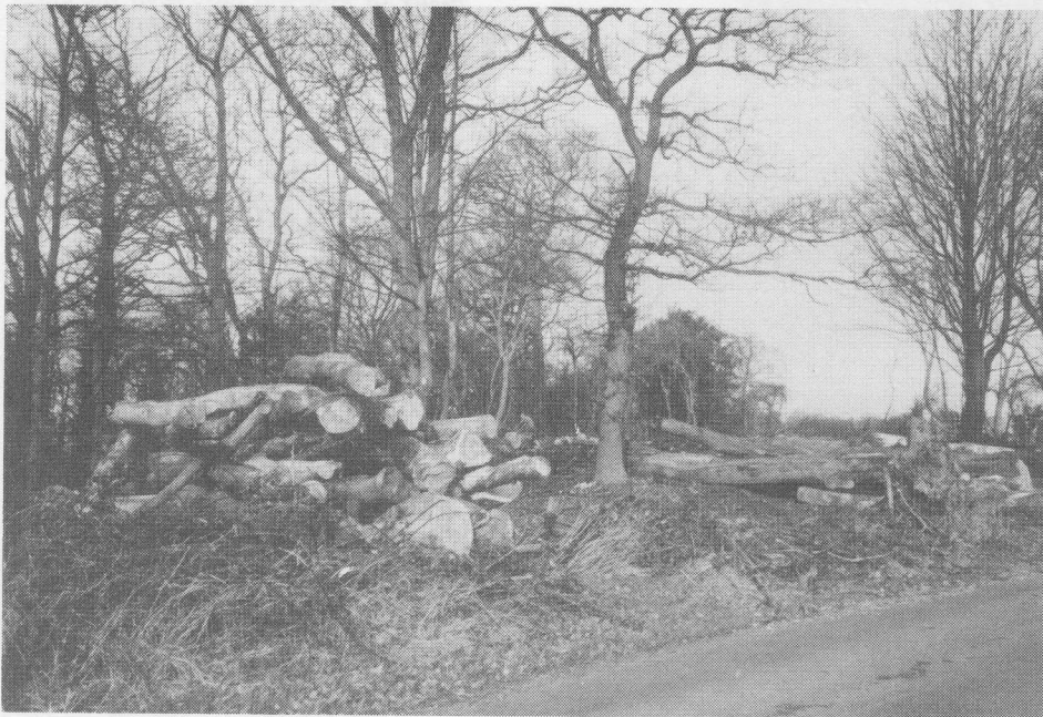
Felled elms and other timber awaiting collection on the edge of the wood on Bluebell Lane. Once all the timber has been removed re-planting is due to take place.

Please keep the leaflet (pin it to your kitchen notice-board, or put it with your Village Information Card) and save your old newspapers, silver foil, old spectacles etc. etc. and take them to the local collector named on the leaflet.