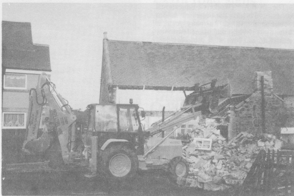
Work in progress to demolish the former caretaker's cottage, the vestry and outbuildings adjoining the Methodist Chapel. Construction of the new building is now underway.