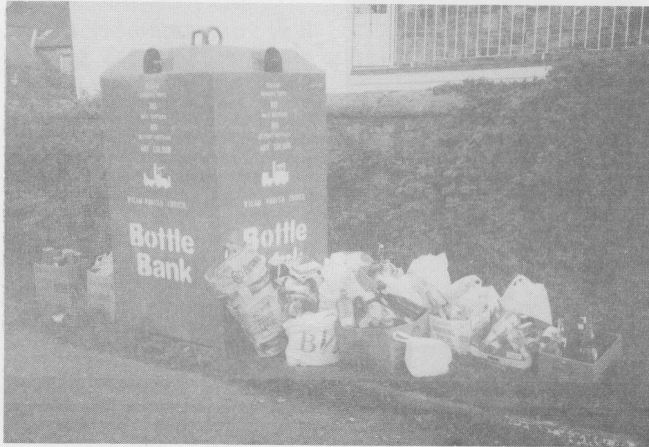
Hopefully a scene of the past, with bottles stacked around an overflowing bottle-bank. The Parish Council hopes that the new larger container will solve these problems.