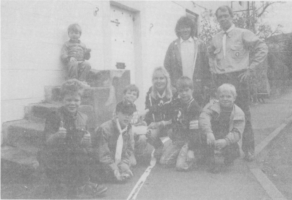
A mile of coins? Not quite, but the Cubs raised a useful sum towards the cost of their equipment store in this fund-raising event in September. It was just coincidence that it ended outside the Black Bull!

Incidentally an "official" opening of the new store will take place after Christmas.