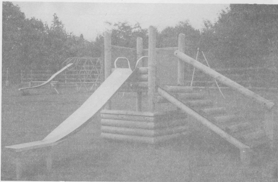
The new slide erected on the Jubilee Field earlier this summer, in a rare quiet moment. Several improvements to this playground and those at Hedley Road and Hagg Bank have, or will shortly be carried out.

Some of the timber items of play equipment on the toddlers play area at Hagg Bank, provided by the Parish Council are also being replaced shortly.