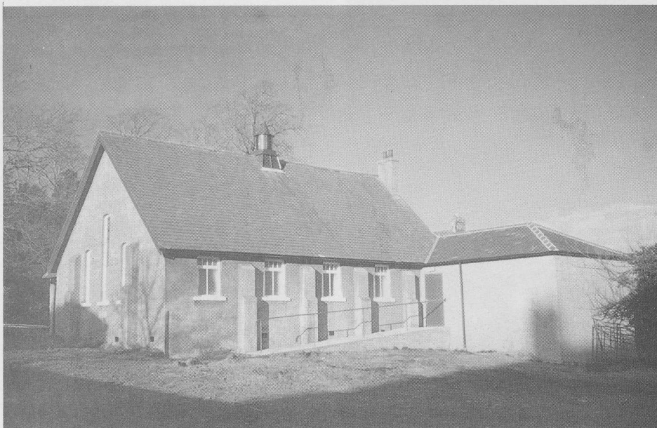
This view shows the neat extension built onto the Church Hall, providing the store for the Scouts and Guides equipment.