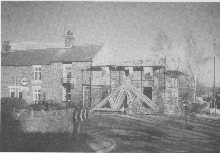
Number 1 Dene Terrace West under construction earlier in the year. Many of the original bricks and slates were reused during rebuilding. The house is now complete, and for sale.

Following concern at the deteriorating condition of the old stone wall on the west side of Cherry Tree Lane and the risk that someone might be hurt by falling masonry, the Parish Council have asked the owners (the Blackett Estate) if they would arrange to carry out repairs.