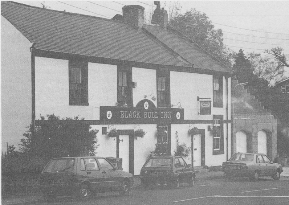
The front of the Black Bull Inn with its elegant new colour-scheme, and attractive new hanging sign has deservedly received favourable comment. What a difference a face-lift can make – and those coloured fairy-lights are now but a memory! Congratulations on the improvements