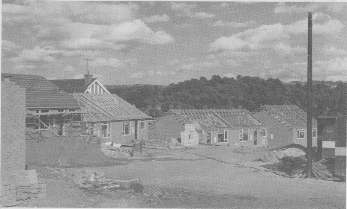
Swindale Cottages under construction in 1981. Several years earlier it had been used for temporary classrooms for the school.