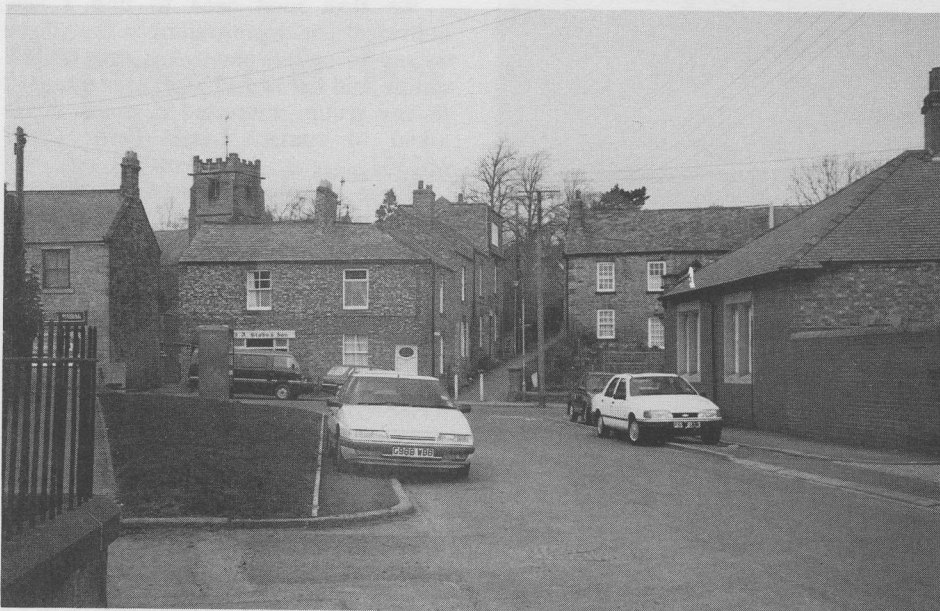
Cars parking "as intended" on the new tarmac strip in Chapel Lane – avoiding obstructing the movement of traffic along the Lane.

The Parish Council are seeking clarification from the Brewery Company on their future plans for their property.