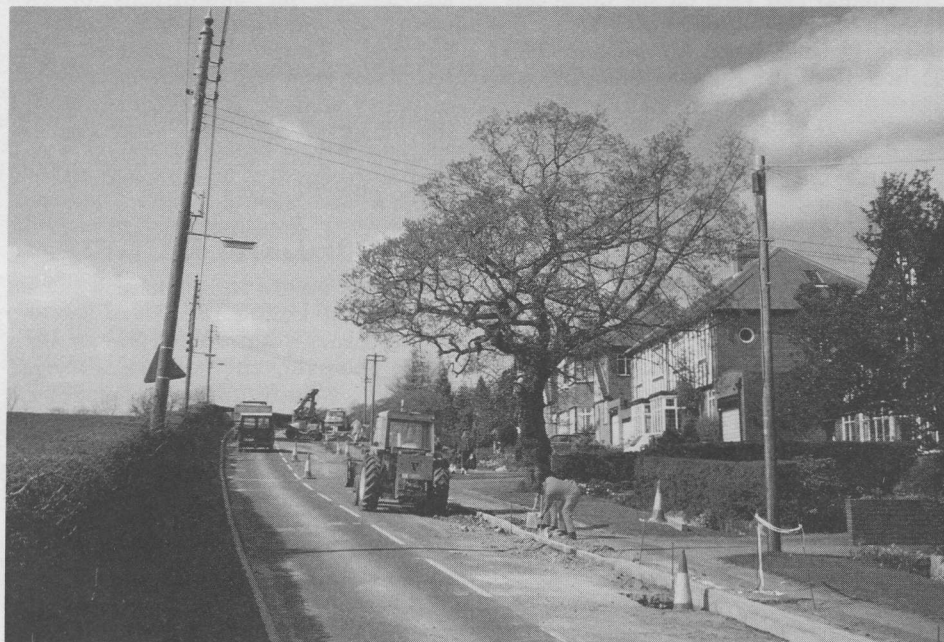
Although the roadworks and temporary traffic lights have effectively reduced the speed of traffic on Holeyn Hall Road over recent weeks, most residents will be pleased that work is nearing completion.

Wylam's recycling efforts have been achieving national and international fame – recently a letter was received from Yugoslavia enquiring about the village recycling scheme!