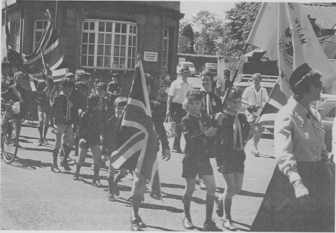
Part of the Carnival procession to the Playing Field, to celebrate the Queen's Silver Jubilee in 1977.