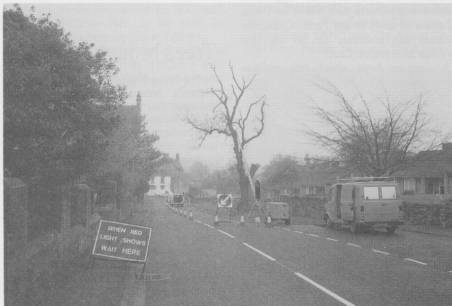
Traffic controls were necessary on Church Road when the old ash tree was felled. The fine copper-beech (right) can now be seen in full glory.