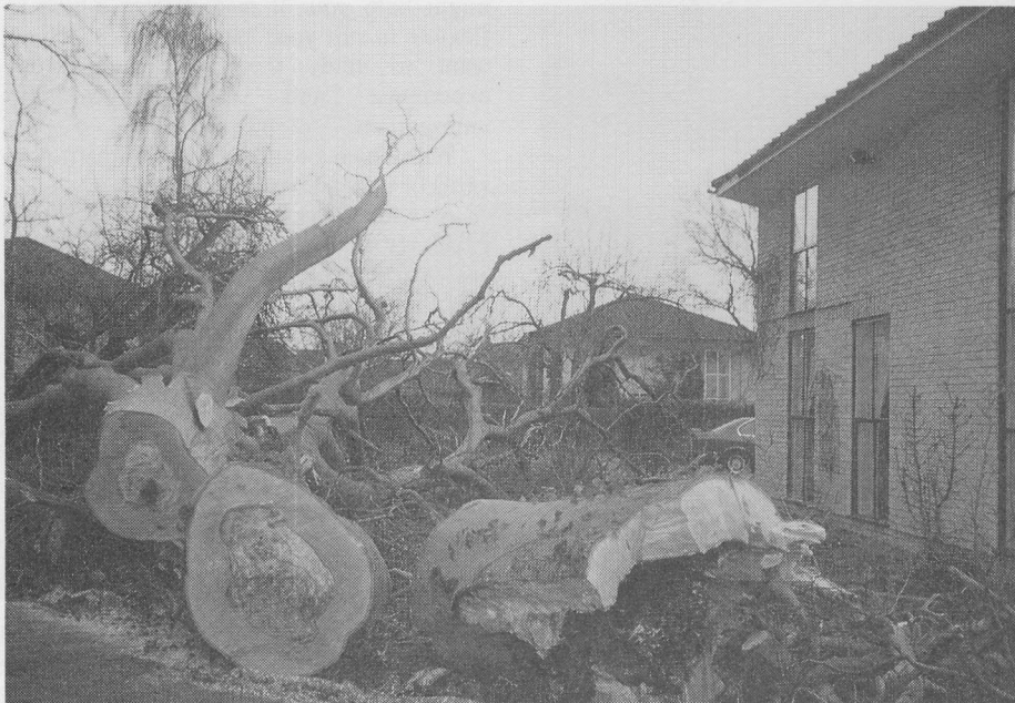
Too close for comfort! The two old beech trees which blew down into the garden of the Leak's house in The Orchard just damaged the guttering. A lucky escape.

Always keen to see new trees planted in suitable locations around the village, the Parish Council is negotiating with Mr. Proud of Daniel Farm to plant some extra trees on the top of Coldwell Hill in South Wylam.