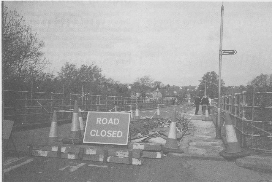
Proof (if anyone needed it) that the river bridge was closed in April for repairs, strengthening, and repainting. The last major closure was in December 1957 when two of the piers were undermined and there was a risk that the bridge would collapse.

All dog owners are asked to ensure that their dogs do not foul any of the regularly mown play areas, verges or amenity areas in the village (but if they do, please make sure you remove the faeces