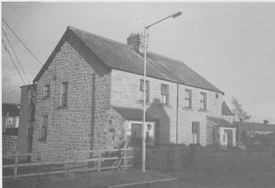
Wylam Hills Farm cottages on Holeyn Hall Road, showing the neat stone porches which have been added to the front elevation, the older, and rather less attractive extensions in artificial stone, can be seen at the rear.

Do this before having detailed plans finalised. Prior consultation may avoid a refusal of planning permission or friction (or both) later on.