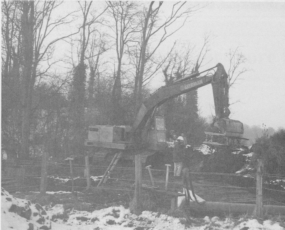
A dusting of snow shows that this picture was taken at the start of work by the NWA on relaying the damaged sewer alongside the old pit heap. A prolonged contract with various problems. Discussions between the Parish Council, the Allotment Association, and the NWA are continuing to make sure that satisfactory reinstatement of damaged ground, fences etc. is carried out.

probably during one of the numerous changes of Clerk which have occurred over the past hundred years. To mark the Centenary, the Parish Council has agreed to have the attractive village boundary signs refurbished, and the "Country Walks in East Tynedale" guide revised and republished. Other ideas for commemorating the Centenary - which runs until April next year, are being considered.