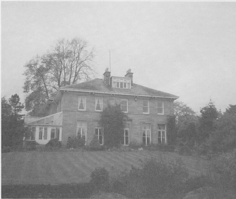
Elmfield, one of Wylam's most elegant houses, was built for a Blaydon doctor over a hundred years ago. Now some of his descendants who live in Queensland, Australia are trying to obtain more information about him and his family.