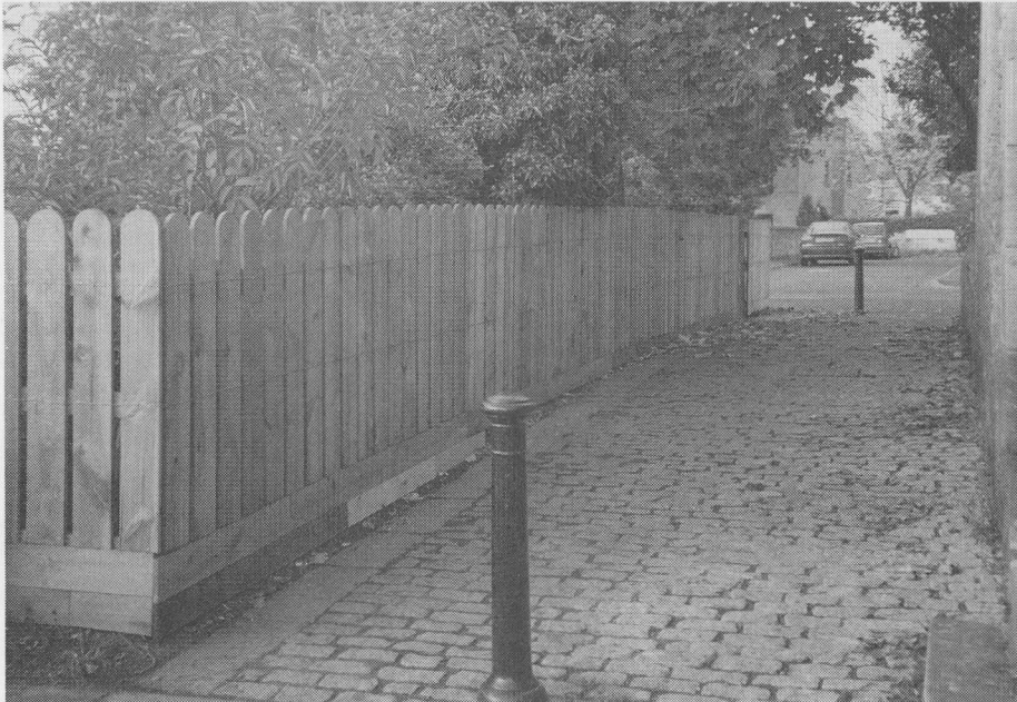
This attractive new fence, and the repairs to the railings around the Institute garden is just the start of a series of improvements which it is planned to carry out at the Institute in the next year or so - to prepare it for the 21st Century! Your help and support will be needed.