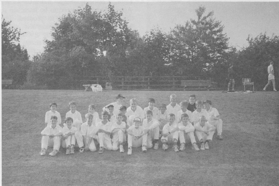
A pleasant reminder of warmer weather - a group photo of the young cricketers who benefitted from the new Coaching Scheme introduced by the Cricket Club this summer. It is hoped to continue the successful scheme next year.

The County Public Transport Officer has notified the Parish Council that changes in the mini-bus service from Crawcrook will be introduced in November. The service will be re-routed up Woodcroft Road, out via Charlie's Corner (existing stop) and down Main Road, with a new stop near the Black Bull.