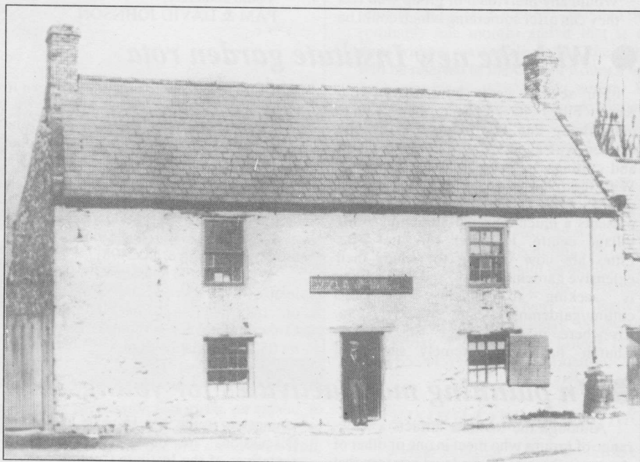
A picture which you are likely to see several times over the next twelve months as we celebrate the Centenary of the opening of the present Institute in 1896. In fact this shows the original “Reading Institution and News Room” which stood on Charlie's Corner next to Brewery House. It was in use from 1850 until the present Institute was completed. It is one of the historic photographs included by Philip Brooks in his new album of pictures of ‘Old Wylam’ just published.