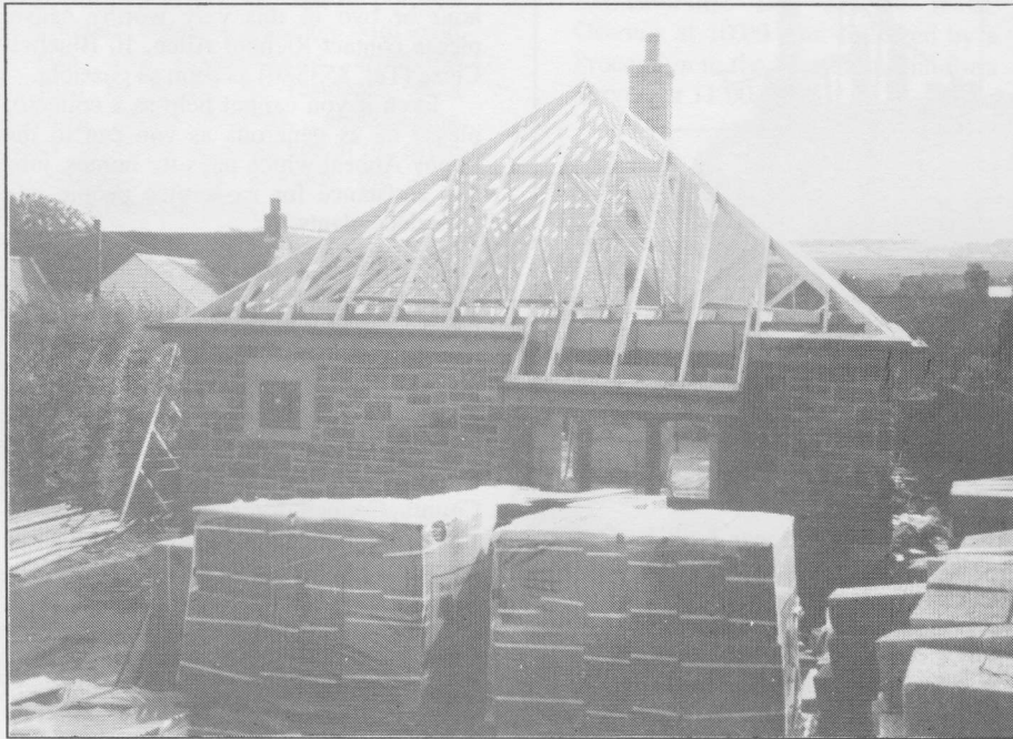
Although there was some local concern when planning permission was given, on appeal, to build a house at the end of Algernon Terrace, the design of the new bungalow now being built in stone and slate should blend quite well with the stone terrace and the Church Hall, without being unduly prominent.