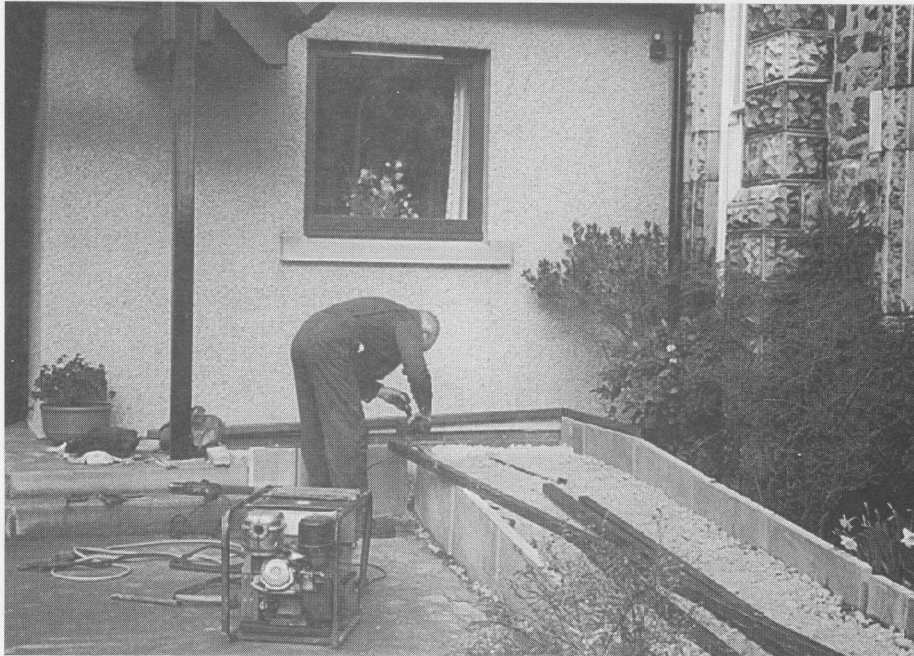
Work in progress on the new ramp at the Methodist Church. It is now completed and is much appreciated by users of the Church Centre, whether in wheelchairs or pushchairs, or those who just prefer a ramp to steps.

The County Council had planned to close the bridge across the river at Hagg Bank, whilst repair and repainting are in progress, but efforts are now being made to keep it open especially for Hagg Bank residents.