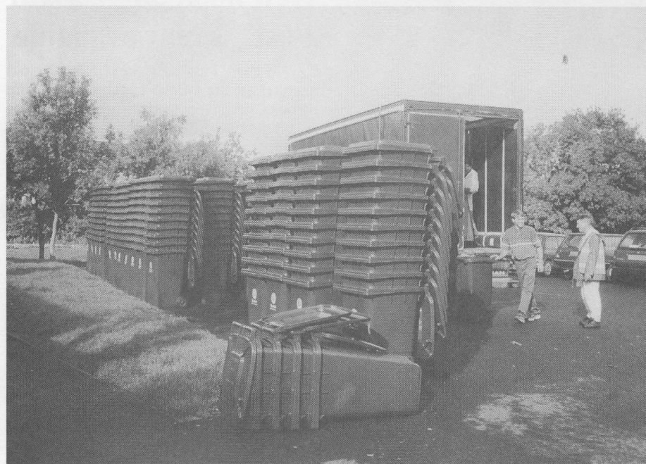
When this picture was taken in the car park late on the afternoon of 7th October, most of the wheelie-bin refuse containers had been distributed to houses around the village. The trial period will continue until March/April. Anyone who experiences problems, or feels the arrangements could be improved is urged to contact Tynedale Environmental Services Department and to notify our two District Councillors.

By the time you receive this newsletter the wheeled-bin trial scheme for household refuse will have been going for two or three weeks. As mentioned in the last "Globe" the trial will run until March/April next year and before it ends everyone will have an opportunity to comment on whether they think the permanent introduction of wheelie-bins is an improvement on the previous dustbin and plastic sack arrangement. In the meantime if you experience any problems please contact the Environmental Services Department on (01434) 652200. Residents are asked not to leave their wheelie-bins on the footpath or road after they have been emptied, where they will cause a nuisance.