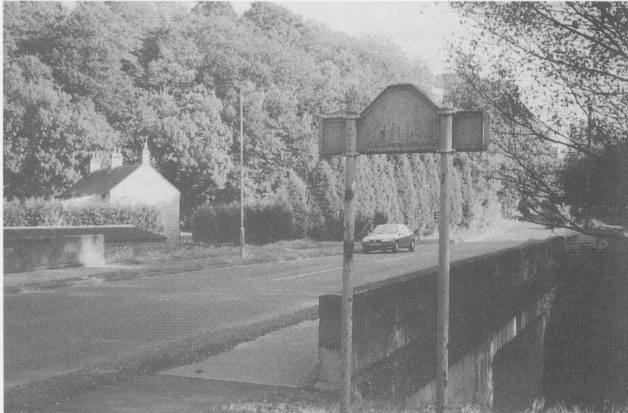
This view shows Stanley Burn bridge, the Crawcrook road and the former Bradley Mill farmhouse as they are today. A photograph in the new book of pictures of Wylam in the past, shows the farmhouse as it was a hundred years ago and another picture depicts the old ford, popularly known as "The Splash", at the turn of the century.

The Open Afternoon will provide an opportunity to see the new-look Falcon Centre recently re-decorated and refurbished, thanks to a team effort, involving various users and supporters. Educational furniture is also on order following a successful lottery grant application. Parents and staff send grateful thanks to all those local people who give encouragement and practical help and support, in so many ways.