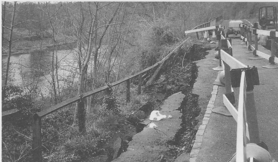
The Ovingham road showing the footpath and bankside which has slipped into the river. Since this photo was taken the trees along this section of bankside have been felled. The County Council have now confirmed that permanent repair work will be undertaken at an estimated cost of some £250,000.

The Parish Council have suggested to the County Council that whilst the road is closed to traffic, the opportunity should be taken to fell several of the dead and potentially dangerous trees along the banksides on both sides of the road.