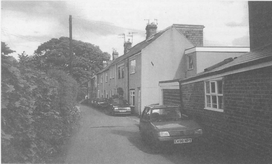
Front Street, Hagg Bank, where residents have purchased the local allotments (on the left) and prepared a scheme to provide much-needed private parking spaces on parts of those allotments facing the street.