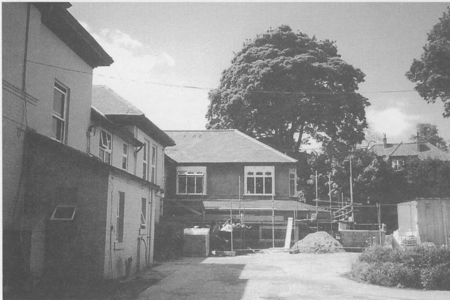
Taken several weeks ago, this picture shows work in progress on the major extensions to the Stanley Burn Residential Home. The new accommodation should be completed shortly and will increase the number of rooms for residents and greatly improve the facilities at the Home.