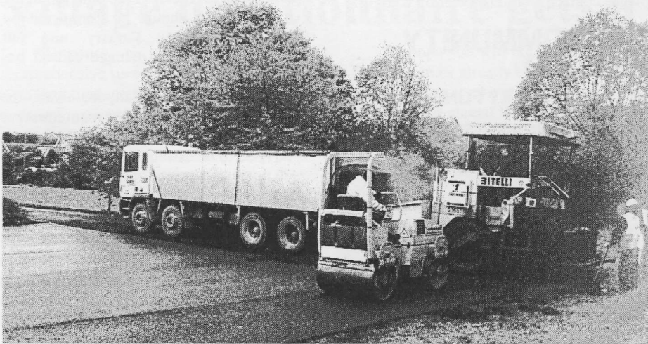
Work in progress on resurfacing the remainder of the Country Park Car Park, which has improved the appearance of the area. Income from parking charges is being used towards the cost of such improvements.

district and parish councils, and the various users of the centre has been examining the problems and possible solutions. Initial action - probably in the spring, is likely to include removal of the old damaged western cycle shed, resurfacing the lower yard area, improved fencing at the back of Swindale Cottages, better lighting and repainting of the exterior of the Falcon Centre building. These improvements and more regular weeding of the garden area should smarten the appearance of the premises.