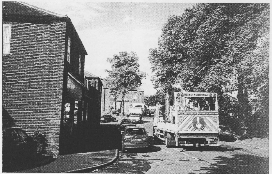
The scene on Ingham Terrace when the lime tree in front of Wormald House (centre background) was being felled by the County Council. Checks are being made on the condition of the other trees on the opposite side of the road.

By the early part of next year it is hoped that all data and opinions from the questionnaires and the public meetings will have been collected and analysed. No doubt there are many people just curious to know where most households shop for their food, or even how many find this newsletter of