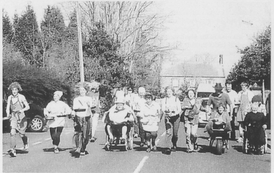
The reintroduction of the Village Pancake races was a great success and was well supported by all age groups. Congratulations to everyone involved. Perhaps it could become an annual event?

volunteers, but others may cost money. One of the main benefits that we expect from the questionnaire and resulting Village Plan is that we now have the supporting evidence to approach appropriate organisations that may be able to help us with advice and perhaps with funds to support community-based projects. If you are involved with such plans, the Parish Council will be happy to provide copies of the document or abstracts from it to assist you.