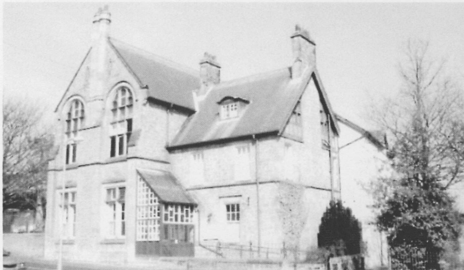
The village Institute and Community Centre looks in fine condition in this recent photograph, but closer inspection has shown that various external repairs will be necessary soon.