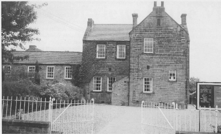
The Brethren have recently created an attractive access and parking area to their premises on Woodcroft Road, in keeping with the tradition and character of the old school buildings, which will be 150 years old next year! A special birthday celebration in 2004?