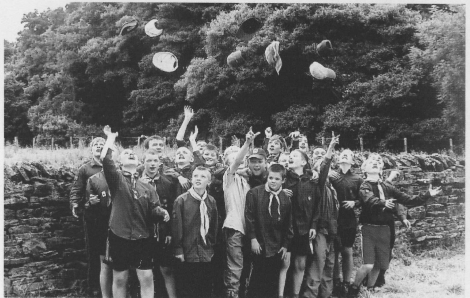
Hats off (except for one!) Scouts from the 1st Wylam troop amongst others enjoying themselves at summer camp held at Hesleyside near Bellingham.