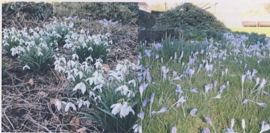
Signs of Spring at Charlie's Corner

This does not, of course, mean that decisions about how local services are going to be delivered have gone away for good, only that they have been deferred until next year. Senior County Councillors have now committed themselves to talking directly to individual Parish and Town Councils (or groups of small neighbouring Councils) over the next few months in order to negotiate