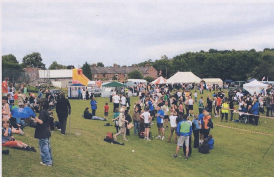
Wylam Summer Fair on the Jubilee Field

By the time you read this it is hoped that the Scarecrow Competition, repeating last year's very successful inaugural one, will be evident around the village. This year, all entrants will be encouraged to judge each other's scarecrows and the winner will be awarded the "Scarecrow Cup" which will be engraved with their name.