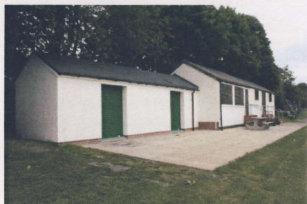
The new pavilion extension

In the coming weeks "a lick of paint" is planned for the outside of the original building and new plants have been added to the patio area. We are very grateful for the financial support received towards this project and delighted to see that the pavilion and playing field continue to be used by many. Ongoing maintenance requires time, effort and money and we would greatly appreciate everyone's co-operation in keeping the field and the