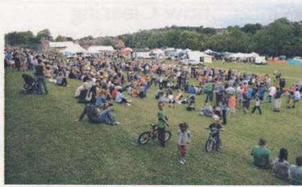
Some of the crowd enjoying the Summer Fair