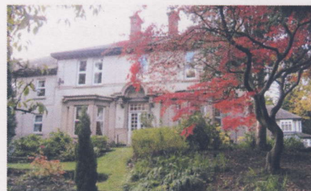
Stanley Burn Care Centre

With the hard work of the staff team and the families of residents, funds have been raised to develop new projects. A recent initiative has been to develop a vegetable garden, improve the flower beds and create a new sensory garden using fragrant plants and flowers, and with plans to use plants which feel different when handled in order to stimulate touch. This project is expected to bring a lot of enjoyment to residents, particularly in the spring and summer, when it is hoped that visitors to events at Stanley Burn will also come to see what's going on and enjoy the experience.