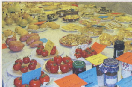
Part of the impressive display of baking at the show

The winning leeks were grown by the old master Bob Straughan, who entered a couple of beauties which were in a class of their own. There was a good array of impressively long beans, parsnips and carrots, giant marrows, onions and beetroot and beautiful boxes of mixed veg. Lovely Chrysanthemums, Dahlias and Gladioli brought a welcome splash of colour to the room as did some magnificent mixed floral displays. As usual all Leek Club members had put a great deal of effort into the baked goods section with mouth-watering results. Cakes, scones, pies, jams and chutneys crowded the central table and were much admired by all visitors.