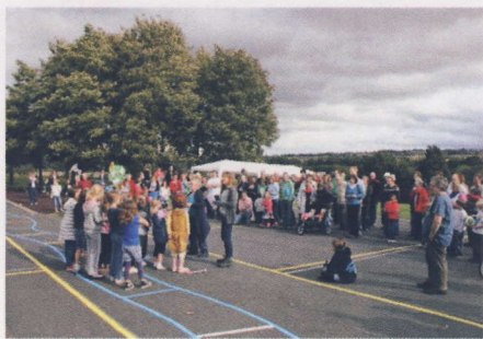
The First School Choir entertaining visitors to the Orchard Open Day

Our master of ceremonies welcomed the first Open Day visitors and as the minutes ticked by, more and more people came to the school field. Many opted for guided tours around the Orchard with an average of 15 people each time, listening to the story. By two o'clock the field was bustling with excitement as the first choir, the "Apple Pip Singers", a local group comprising members from many different choirs, took its place. They sang beautifully, finishing with a wassail, a song to the trees of the Orchard to promote good growth and a harvest. The Wylam First School Choir then took centre stage and charmed us all with a selection of local tunes and others from across the world. We were finally serenaded by two young local folk singers. All this time the sun was shining and people were wandering around the stalls and the Orchard.