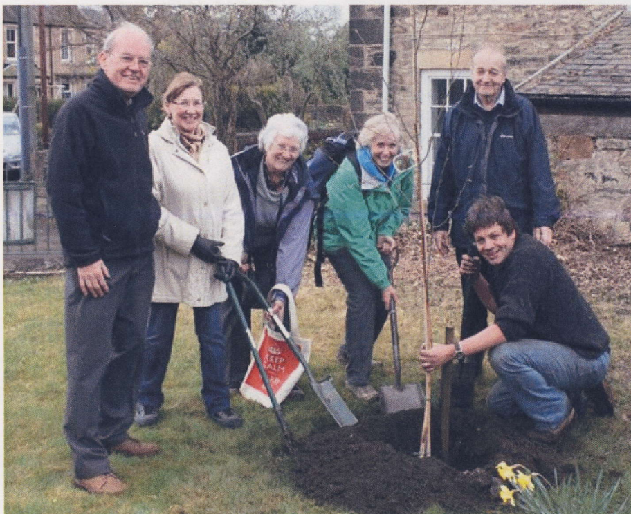
The above picture shows a group representing the Parish Council who took part in the ceremony.