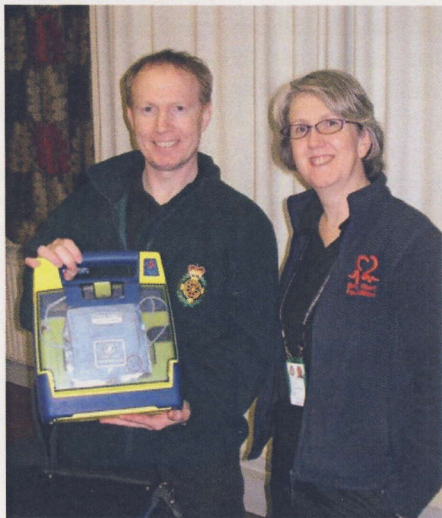
North East Ambulance Staff with an automated defibrillator

In February, a dozen or so people attended an open meeting arranged by the Parish Council, at which staff from the North East Ambulance Service described how people can help to save lives when there's a local life-threatening emergency.