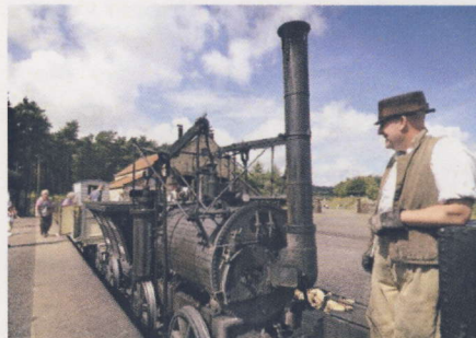
Puffing Billy Replica at Beamish

Many events will take place throughout the summer and we can announce that the full-size working replica of Puffing Billy from Beamish Museum, shown here, will be located in the Country Park Car Park in Wylam on Saturday 21 September.