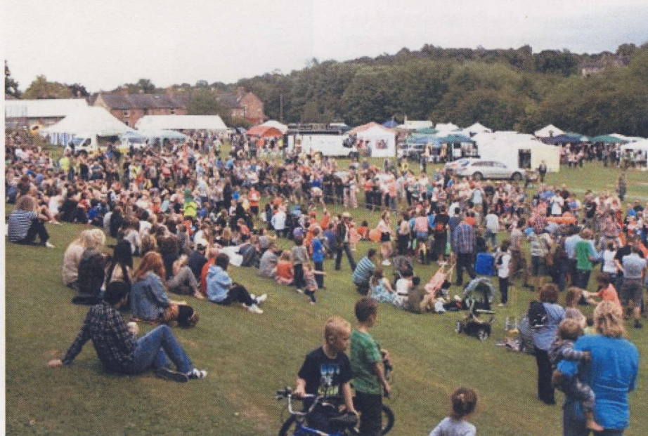
Let's hope the crowds and sun turn up as on this previous occasion

Proceeds from the Summer Fair contribute to both the on-going maintenance and further development of the Playing Field, play equipment, pavilion and grass cutting equipment. The Playing Field is owned by Wylam Community Playing Fields Association, not Northumberland County Council, and is home to several village sporting teams and is free to use by all members of the wider community. The committee of The Playing Fields Association value the tremendous support provided from the village and hope that young and old will join us to make the 2013 Summer Fair a memorable event.