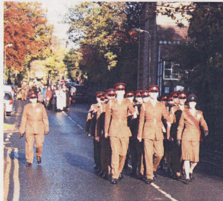
Soldiers from Albemarle lead the Parade in Church Road

The temporary road closure, effectively managed by staff from Northumberland County Council, also did much to enhance the poignancy of the occasion by bringing peace and tranquillity to a normally busy section of the road.