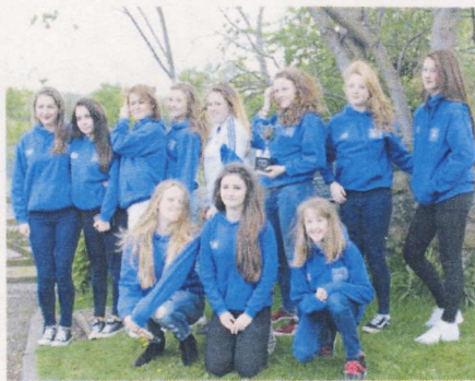
The Winning Under 14 Team