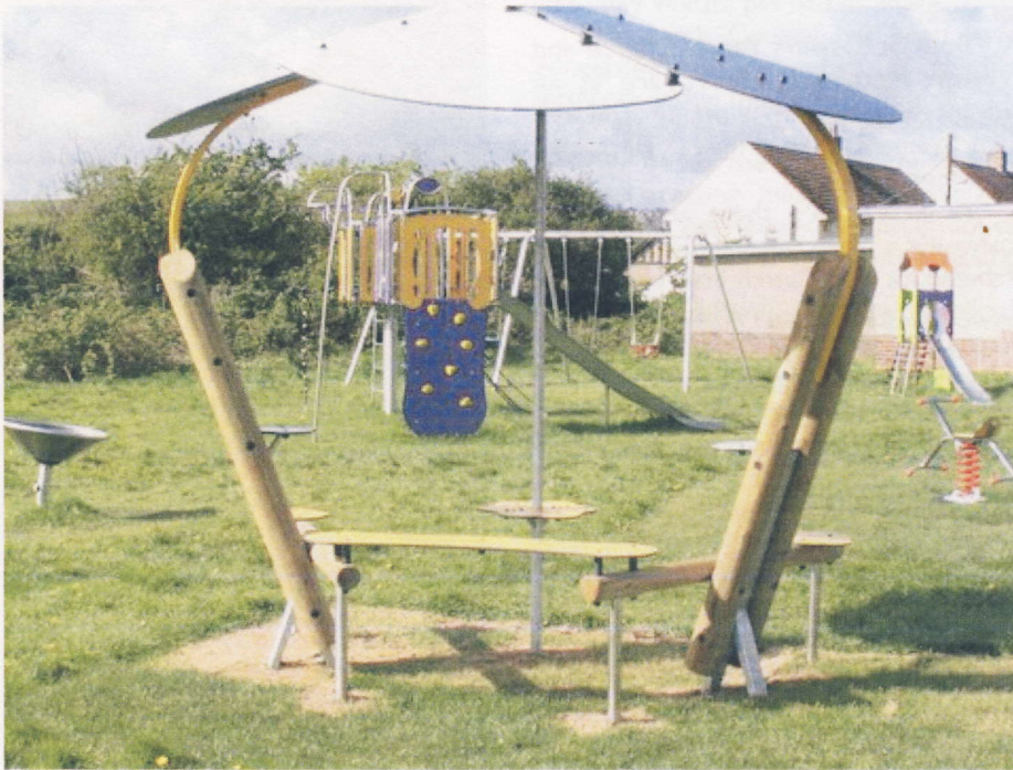
Some of the new play equipment

The planned improvements to the play area beside Hedley Road, which is owned by ISOS Housing, have recently been completed and can be seen here.