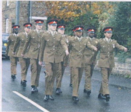
Men of 3 Reg. Royal Horse Artillery in Wylam

Several of the soldiers expressed appreciation for the welcome they received in Wylam and admitted it was nice to be able to converse with local people in English.