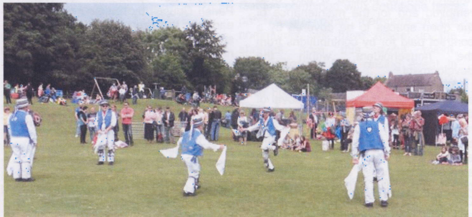
Hexham Morris Men at the 2016 Fair