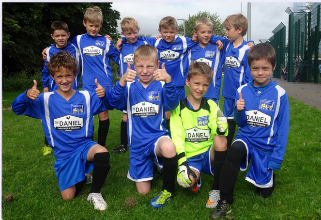
Wylam Rockets FC U10s, sponsored by Daniel Farm