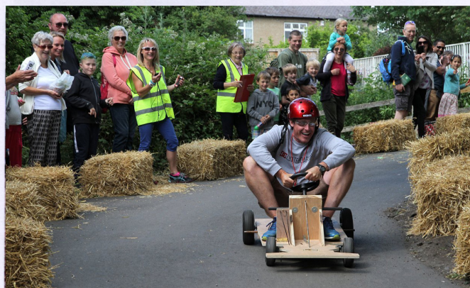
Bogie Time Trial - Old Skool flat out - No Fear!