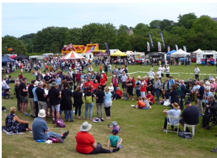
Enjoying the show

Wylam Community Playing Fields Association (WCPFA) is a registered charity, which provides sporting and leisure facilities on the Jubilee Playing Field. WCPFA holds four fundraising events each year, comprising a Jumble Sale and Burns Night Ceilidh in January, a Music Quiz in May and the Summer Fair in June. The Music Quiz attracted over 90 people this year and raised over £900. This was quickly followed by the Summer Fair on 23 rd June, when about two thousand people enjoyed a sunny afternoon on the Playing Field, visiting the village and commercial stalls, fairground attractions, food outlets, Beer Tent and Pimms Bar.