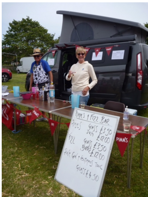
The Pimms Bar

The Summer Fair also coincided with the completion of the installation of the Pump Track and 3D Climbing Blocks on the area adjacent to the Multi User Games Area (MUGA). This was made possible by grants from the Housing Developer Fund for Sport and Play at Northumberland County Council and the Northumberland Masons respectively. The Pump Track is ideally suited for younger children on scooters, balance bikes and skate boards, whereas the Climbing Blocks are suitable for older children too. It was good to see these facilities used by children at the Summer Fair and over subsequent months.