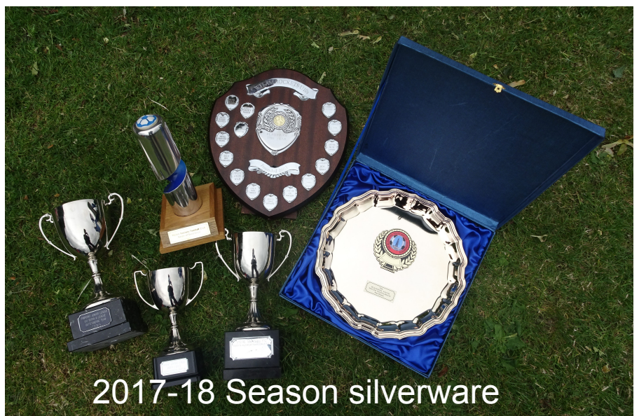
2017-18 Season silverware

Wylam Rockets FC is a Charter Standard Club and provide grass