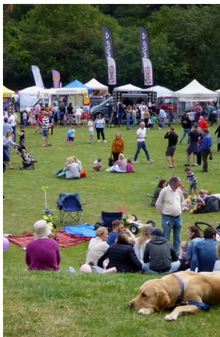
Lazing in the sun

The WCPFA Committee are currently considering a number of projects, including the installation of CCTV, enhancing storage facilities and improving the drainage of the field. Future fundraising events include the Jumble Sale and Burns Night Ceilidh (See 'Forthcoming Events').