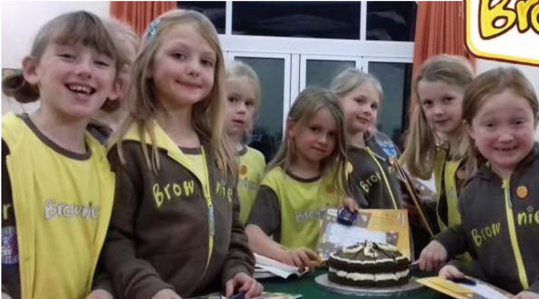
Wylam Brownies celebrating making their Promises

Wylam Brownies have had a fantastic term. The girls have thrown themselves into Girlguiding's brand new programme with gusto earning over 20 interest badges between them, ranging from Collecting and Baking to My Rights and Local History. Resources for the new programme including a Badge Book for each Brownie are being bought with grants from Girlguiding Tynedale East Division and Wylam Parish Council (outcome to be decided at December meeting) for which Wylam Brownies are very thankful.