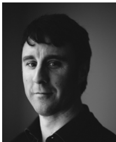
The Big Blind

Tickets for all events are now on sale from Wylam Spar, the Queens Hall and the Festival website. Wylam Winter Tales is run entirely by volunteers on a not-for-profit basis as a local voluntary organisation. Any surplus is put back into the following year's events. New Festival Volunteers are always welcome, so if you're interested in being part of things get in touch with the organisers at wylamwintertales@gmail.com . Come along and support your Festival!