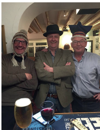
Mad as a hatter?

Friday 29 March is Wear a Hat Day, the national campaign for Brain Tumor Research. Wylam has taken this to its heart for the last 2 years with the First School, shops, restaurants, pubs, businesses and local organizations organizing all sorts of events and offers either during the week or on the actual day itself.