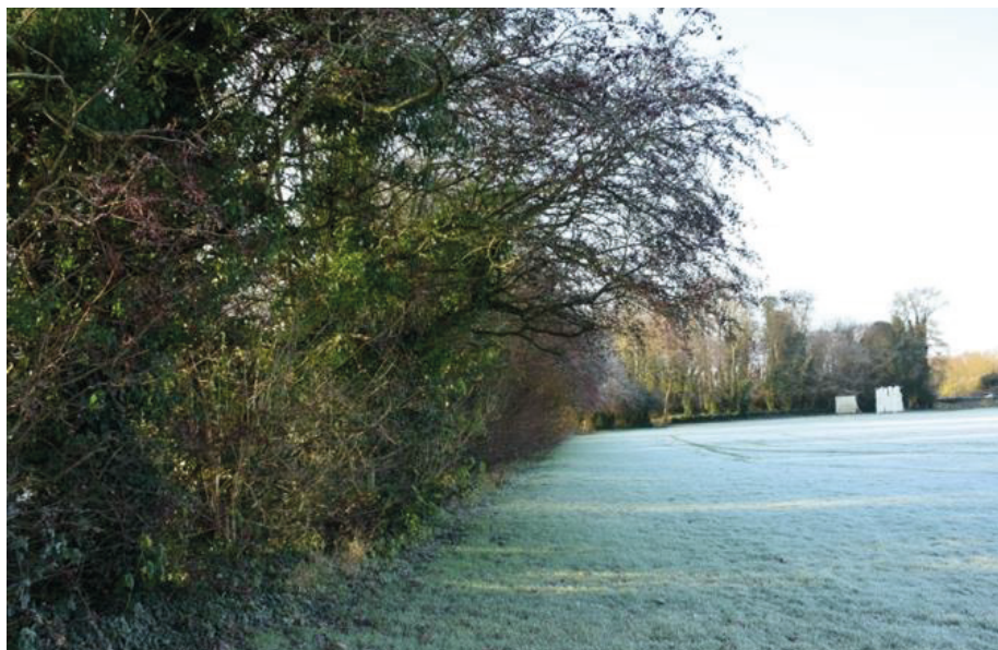
Before, shows shaded area

Players are already appreciating the improved lighting and space it has given – just look at the difference in the photographs.