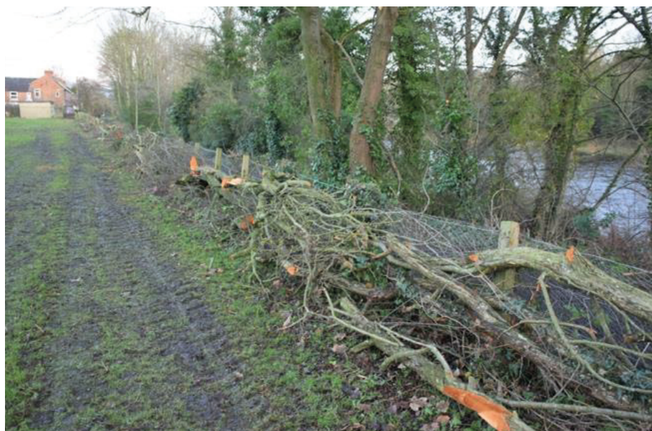
After, showing the laid hedge