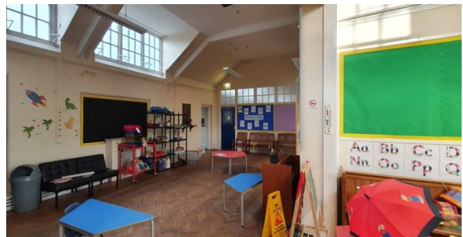
Falcon Centre main hall