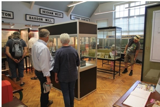
The Railway Museum

A step to secure the future of an important building in the village was taken on 17 February 2021 when the Falcon Centre Action Group held its first formal General Meeting (online of course). The meeting adopted a Constitution. It is now an Unincorporated Association - a move to being a charity or similar may follow in due course.