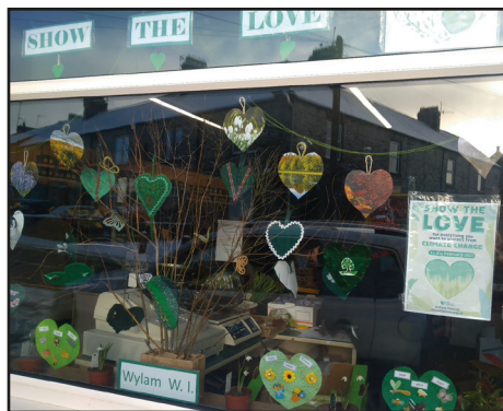
Stobo's window display "Show the Love"

The Zoom meetings were well attended by about 75% of our members, and we ran support classes on internet usage, so that in the end we had 80% of our members attending. For those who had no access to the internet we started a monthly news sheet with quizzes and all the news of our branch and what was going on in the Federation.