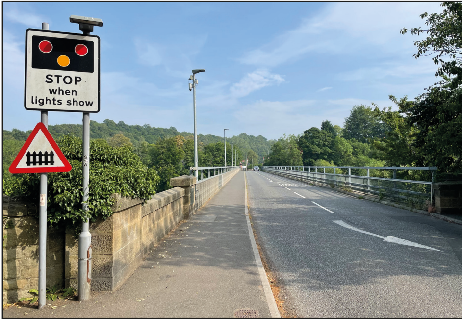
Wylam Bridge, looking south

Northumberland County Council (NCC) is planning to carry out works on Wylam Bridge.