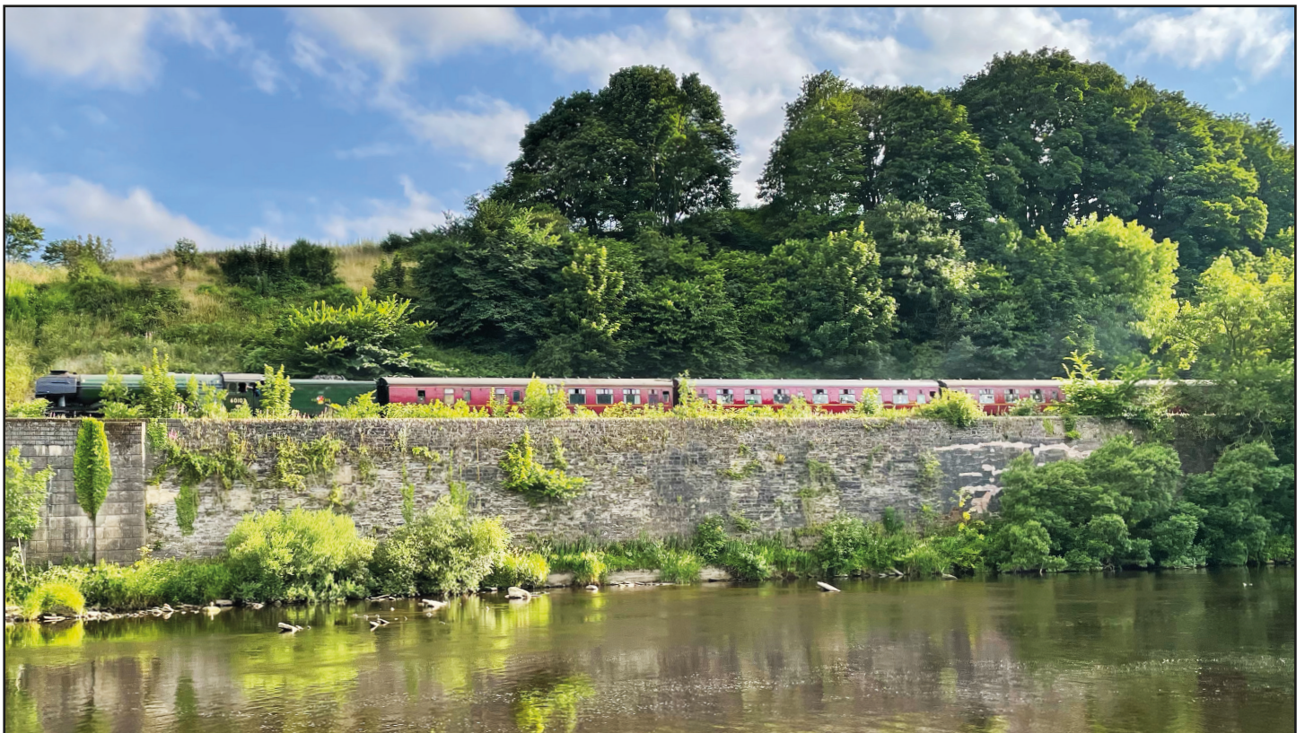
COVER PHOTO : The Flying Scotsman passes Hagg Bank on 24th July 2021

How Wylam WI have been keeping busy, connected and very creative during lockdown - see page 4