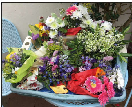
Posies with Sunday lunch at The Black Bull

We co-operated with the Wylam Community Help Covid19 Group and the Black Bull by creating posies to go with the Sunday lunches they were delivering to isolated people.