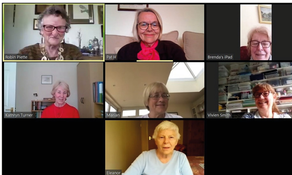
Wylam WI Committee Zoom meeting

We've been working hard to keep our members happy. We've been online and found interesting speakers for our Zoom meetings, including the Pearl Lady who lives in France, and the Gin Lady who made us all very happy.