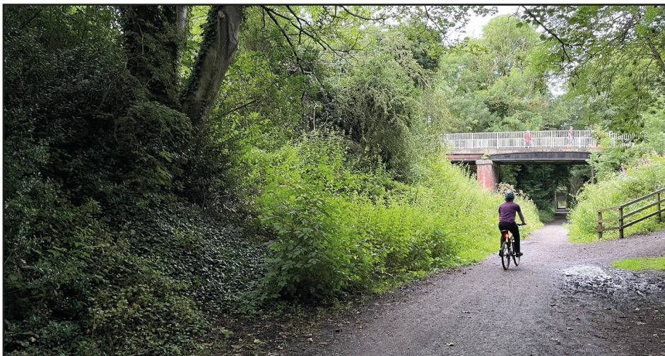
Wylam Waggonway, recently the scene of illegal motorcycle riding

Following the significant increase in incidents of anti-social behaviour (ASB) experienced in, and around, Wylam since the first period of lockdown in 2020, the Parish Council has worked with both Northumbria Police and Northumberland County Council to ensure that measures are in place to tackle issues which have