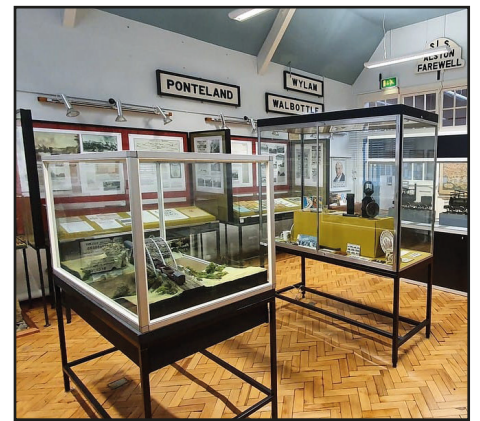
Wylam Railway Museum - Volunteers needed

Work continues with the National Trust to form a Wylam Heritage Partnership. An early action is to reopen George Stephenson's Birthplace and the Parish Council's Railway Museum in a coordinated way. Volunteers, for museum supervision and to lead guided walks, will be needed. We also want to promote wider discussion about the future of the Railway Museum in the context of the debate about the future of the Falcon Centre. Contact the Parish Council Clerk if interested (contact details on page 8).