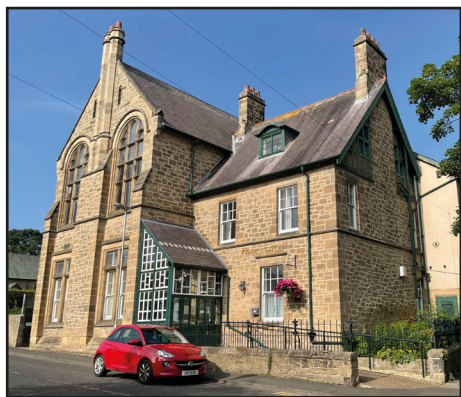
Wylam Institute, usual venue for the Annual Village Meeting

The Parish Council usually arranges an Annual Village Meeting in May of each year. We were unable to do so in 2021 due to pandemic restrictions.