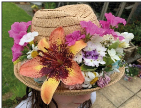
"Wear a Hat Day"

Easter, bags with a primula in a pot, a crispy cake with fluffy chicken and a poem.