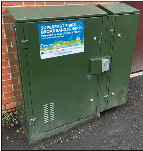
Current BT OpenReach "Superfast" Terminal on Woodcroft Rd

The pandemic has brought the need for fast and reliable broadband into sharp focus. As a Parish Council, we have been looking at ways to improve broadband service to the Wylam area.