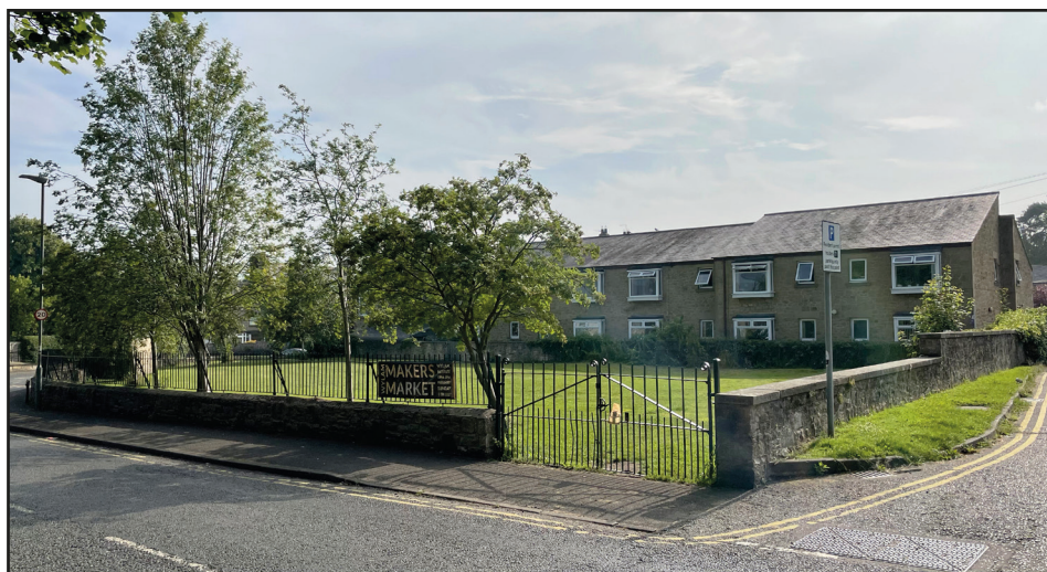
Charlie's Corner viewed from Wylam Institute

At its meeting on 10th May 2021 the Parish Council received a petition and heard residents' comments regarding the use of Charlie's Corner by dogs and their owners.