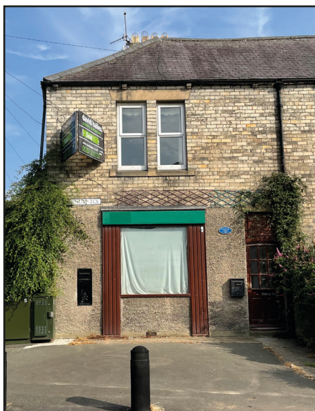
The former Post Office, Laburnum Terrace

The Parish Council is pleased to report that the sale of the former Post Office, at 3-4 Laburnum Terrace, is progressing well and we are hopeful that the sale will be completed in the near future.