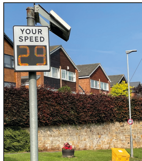
Speed detector on Main Rd

In October 2020 the Council submitted its Local Transport Plan priorities for 2021-22 to Northumberland County Council (NCC). The key priorities focussed on: