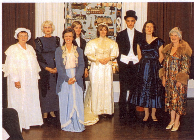
Drama Society models in some of the Historical Costumes

Thank you to everyone who organised the week and to those of you who supported the many activities and spent so generously.