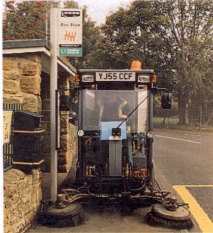
No, not the replacement 684 bus

Wylam has recently received a welcome visit from a pavement sweeping machine, seen here in action in the village. This is one of two currently hired by Tynedale Council prior to the arrival of a new machine. Paths throughout the District