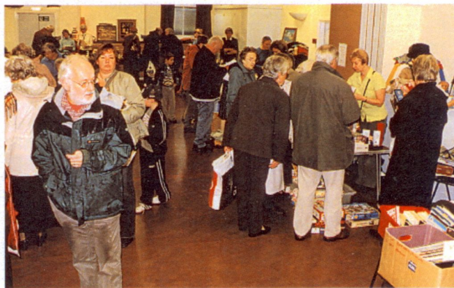
Table Top buyers defy the wet day to clinch a deal