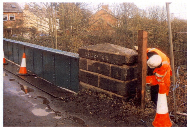
Work in progress on the bridge

Some inconvenience and disruption has been caused at Hagg Bank recently, where contractors for Network Rail have been carrying out major repairs to the road bridge across the railway, which connects the community there with the outside world.