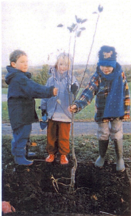
Young tree planters need support - for the tree

Copies are available from the school office.