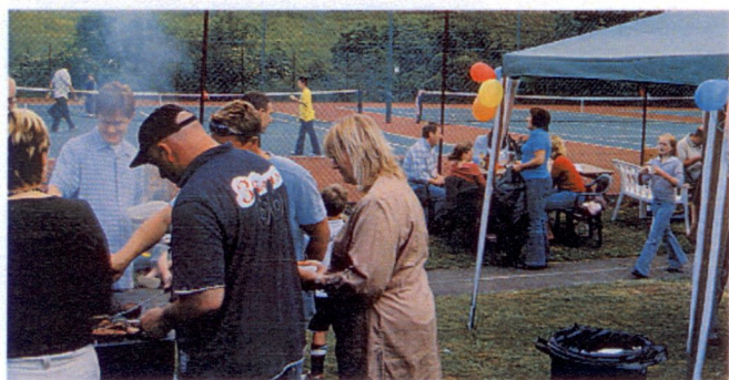
Tennis Club members celebrate with a barbecue