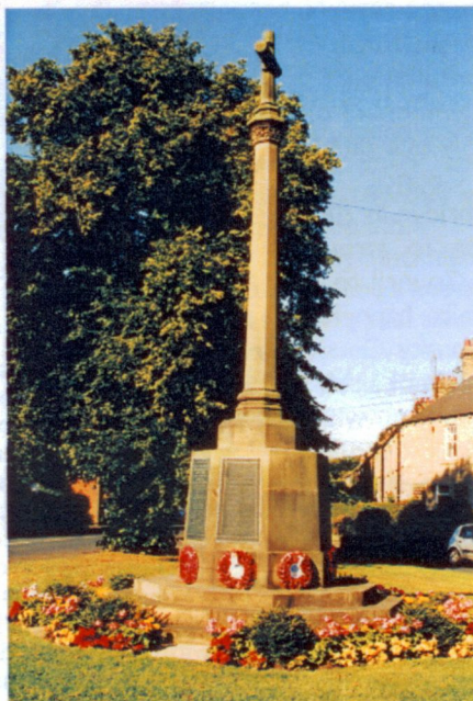
Flowers at the War Memorial looking at their best

We are very grateful to all those who contribute to the attractiveness of our village, not forgetting those businesses and individuals who take steps to ensure that passers-by can enjoy the experience.