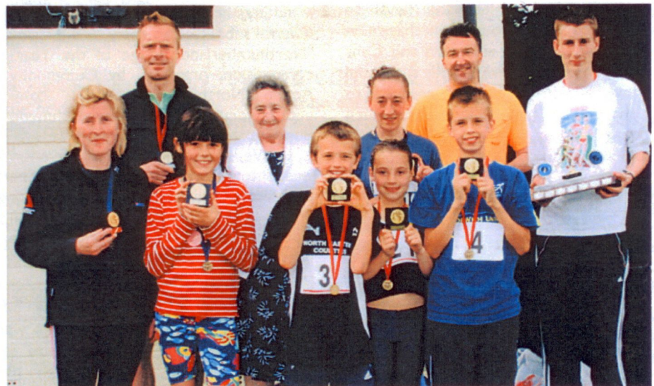
Winners of the Summer Fair 'Fun Run' with representatives of the sponsors, Wylam Spar

Work planned in the near future includes improvement of the drainage at the west end of the field at a cost of around £2,000 and it is hoped to start work on the pavilion extension in 2008. The AGM will take place in the Institute on Monday 5 November at 7.30pm, when all are welcome to come along.