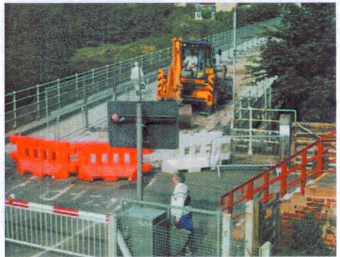
Work getting started on Wylam Bridge

Finally, in case it is not clear by the time you read this, there never has been any intention to replace the present railings with solid panels that will hide the river from view. The new barriers, embedded into a new and reinforced edge to the bridge deck, will comprise galvanised steel posts carrying four horizontal rails with the lower part covered in steel mesh, not unlike at present.