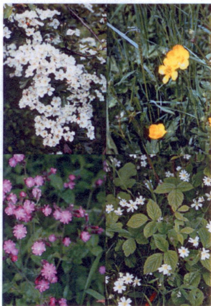
A few delights recently to be seen on the Nature Reserve

There now seems to be plenty of bird food about, both natural and provided, and we have consequently stopped providing food at the feeding station, at least "officially". Some people are continuing to supply table scraps, bruised fruit etc, and they don't last long. It may be of interest to readers that we know of groups of students from at least two university courses that currently make use of our nature reserve as part of their studies. We are pleased to welcome them to this splendid resource.