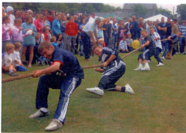
These lads were pulling together for the Summer Fair

Entry to the Field and the Bookstall is with a programme available at the Playing Field gate or Methodist Hall. Regrettably after many years entry charges have been increased to £1.50 for adults, children up to 15 years remain at 50 pence and a Family ticket at £3 for 2 adults and up to 4 children is a bargain! Have a Nice Day!