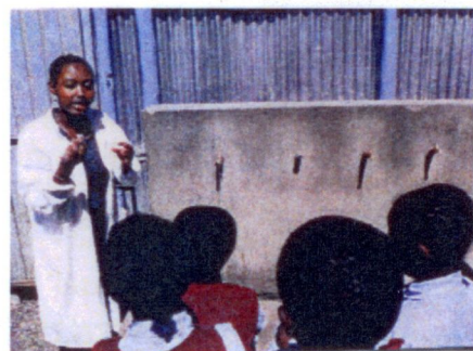
Ethiopian children learn the basics about hygiene

A year ago we reported in these columns that the Wylam and District Churches had exceeded their target and had raised almost £4000 for a Water Aid Project in Mali. Buoyed by this success and challenged by Water Aid having raised the stakes to a minimum of £5000 for groups wishing to sponsor a specific project, this is now a fresh target that, with everyone's help, they are hoping to achieve by 31 March 2009.