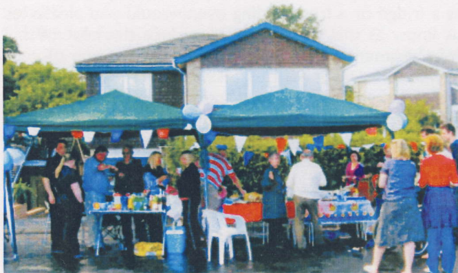
The Bluebell Close party in full swing

A summer street party on Bluebell Close was a great success. Despite the frequent showers on Saturday 19th July neighbours managed to summon up the spirit of summer and gather for a street party. The downpours didn't put a dampener on the day and the Close was decorated with balloons and bunting, some of which had not been hung up since the Silver Jubilee in 1977! The street party was a good opportunity to gather with neighbours and friends for a barbecue and lots of home made cakes. More than half the houses in the Close were represented, from neighbours who had just moved into their home the day before, alongside those who have lived on the Dene Estate since the houses were built. The community party included babies, children, and adults of all ages joining together in the road. The street party organisers, Andre Terblanche, Simon Hackett, and Hilary Broomfield are grateful to all of the residents of Bluebell Close for turning a miserable rainy afternoon into a really memorable day!