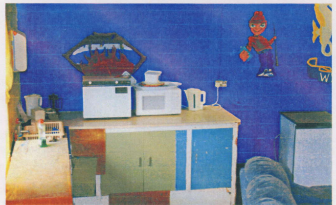
The present Falcon Centre kitchen which it is hoped to replace

Should anyone know of a new kitchen being ripped out and dumped, or indeed any newish appliances such as a fridge or a freestanding oven, would you please let us know as this would help us reduce the cost of this refurbishment work. For more information: contact Wylam Pre-School Playgroup by email wylam.playgroup@live.co.uk or ring the Falcon Centre between 9.15 and 11.30 any morning on 852174.