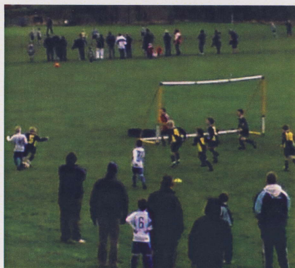
Some of the 'Rockets' in action

The success of the exercise, whenever it begins, will still depend very much on the participation of a wide cross-section of the local community and we would still like to hear from anyone who would like to become involved.