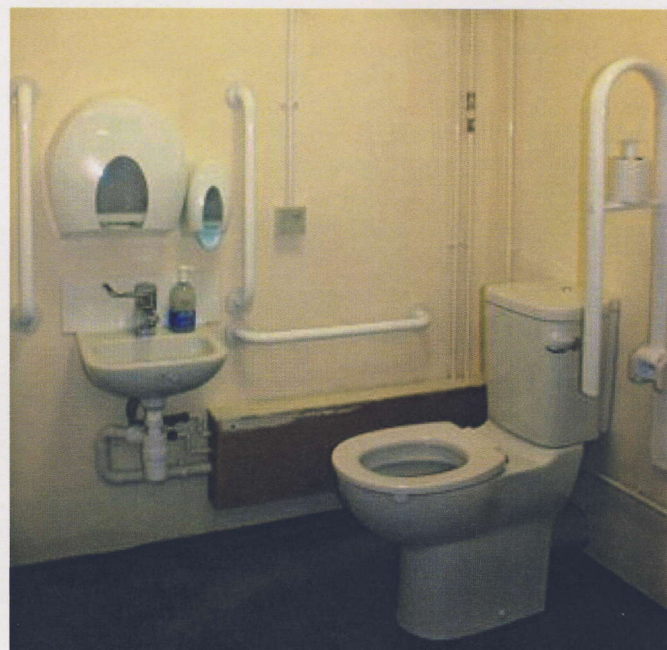
Two of the refurbished areas

Museum: As we reported in December, the Railway Museum within the Falcon Centre had to be completely cleared for the re-wiring and for repairs to the floor and so the Parish Council has taken the opportunity to have the room redecorated. Some of the exhibits have been returned from storage but the displays for the wallboards are currently being refurbished by Tynedale Council Museum staff. As soon as this work is complete and the displays restored, the Museum will re-open.