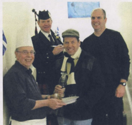
Some of those that brought 'flavour' to the Burns' Night Ceilidh

The Playing Field Association made a good start to 2010 with the 23 rd Annual Burns Night Ceilidh, which was attended by over 100 people and raised around £900. The Jumble Sale, postponed from January to February because of the weather, raised an additional £1200. This still leaves a gap of nearly £10,000 to be raised before the extension to the pavilion can be completed. Hopefully, a number of bids to charities for assistance will be successful and a profitable Summer Fair on 26 June might still enable the work to be completed this year. Thank you to all those who bought tickets or helped in other ways.