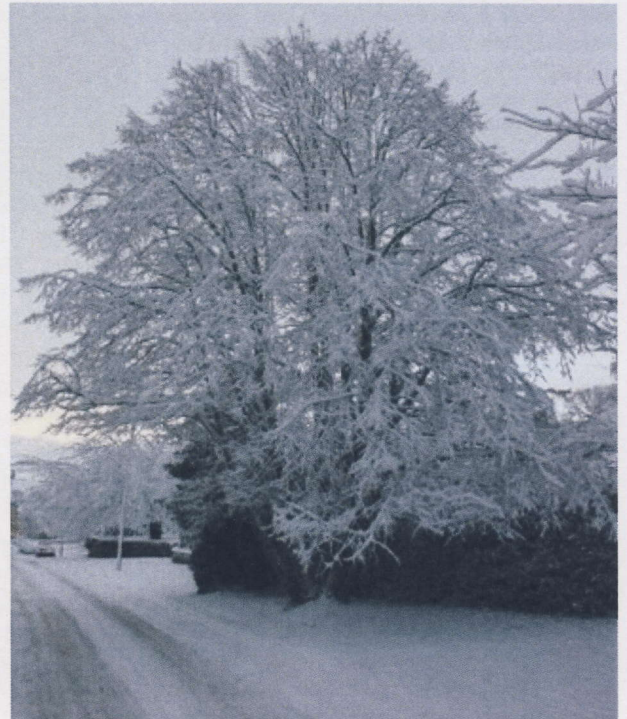
Church Road on New Year's Day

Another positive was the opportunity to see our village in a beautifully different light, with the snow creating some amazing scenery. No doubt many of us have images like the one here to remind us of this.