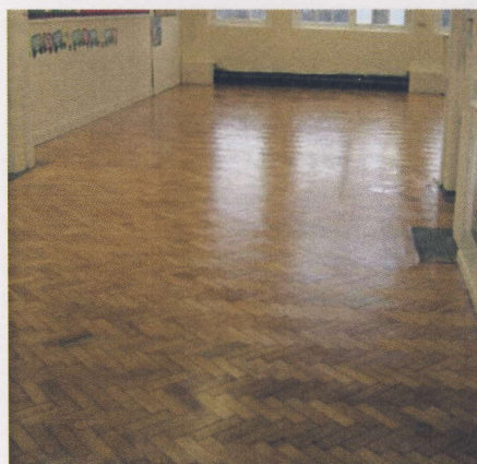
The refurbished floor

Wylam Playgroup is now open five mornings a week at the Falcon Centre. Sessions run from 9.15 to 11.45a.m, Monday to Friday. Last year, OFSTED rated Wylam Playgroup as "good with outstanding elements", which is a wonderful achievement. The Playgroup has a strong level of support within the village and we are proud to maintain a high standard of service for the children.