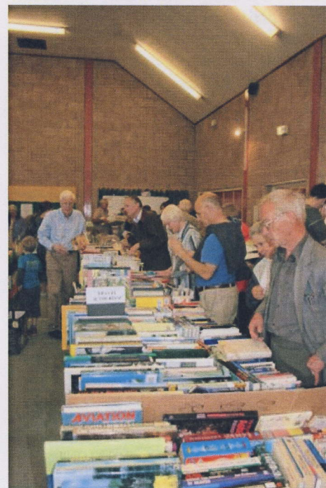
A small part of 2009 Bookstall