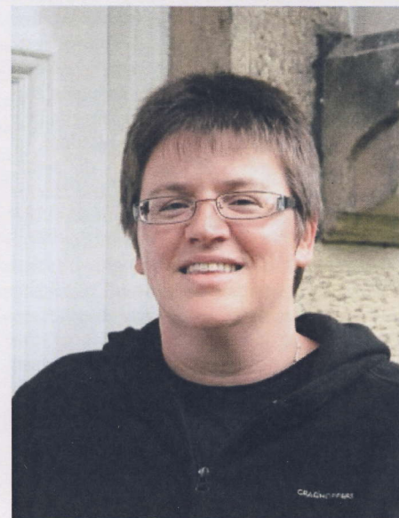
Welcome to Jane