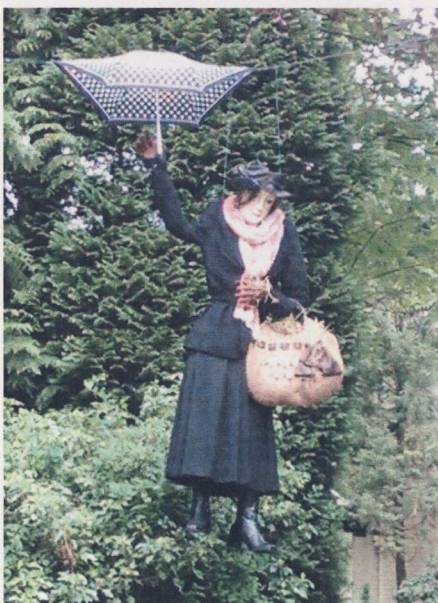
The winning Scarecrow

Wylam must have been crow free the week preceding Wylam Summer Fair. Everywhere you looked there appeared a scarecrow, in fact more than 60 eventually adorned the village. First prize was awarded to the floating Mary Poppins in South Wylam, where the second prize winner was also to be seen in the form of a very creative "policeman", which succeeded for some time in reducing the speed of passing traffic. Other imaginative creations included climbers, builders, a burglar escaping with a bag of swag, "Spiderman" climbing a tree and some motley looking characters outside the Black Bull, and Stobo's shop. The scarecrow idea certainly caught on and the committee are very grateful to all the individuals, families and local businesses that entered into the true spirit of the event. Next year, it has been suggested that prizes should be awarded as a result of a public vote and rumours already abound that there may even be mechanised characters emerging in 2011.