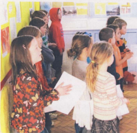
The First School Choir